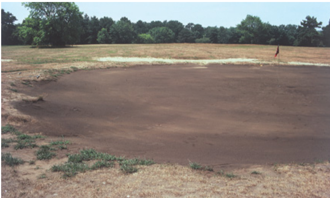
Although few sand greens still exist in the United States, they were much more prevalent in the early years of golf (Sag Harbor Golf Club, New York).