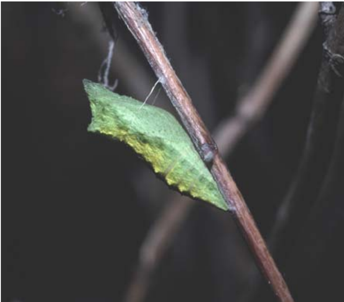
Butterflies will overwinter as an egg, caterpillar, chrysalis, or adult, depending on species. Those that overwinter as a chrysalis, such as the anise swallowtail shown here, generally find sheltered vegetation on which to spend the winter months.

landscapes altered by agriculture and urbanization. Stepping-stone habitat patches, which may be nothing more than “weeds” growing on a pond margin or on a road verge, can meet these needs. A tolerant maintenance crew that leaves these areas to grow rather than cutting or spraying them may help provide the feeding or egg-laying resources these migrating pollinators require. So too with each small area of pollinator habitat created on golf courses. Left undisturbed, a patch of forage habitat or hostplants may reward you with the sight of a newly emerged butterfly warming its wings on a cool morning.