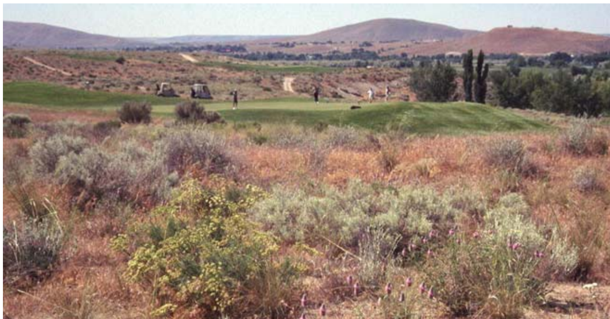
Pollinator conservation is an issue of growing national urgency. Golf courses can provide extensive areas of suitable habitat in out-of-play areas.

The National Academy of Sciences report, Status of Pollinators in North America (NRC 2006), identified habitat loss and degradation as two causes of pollinator decline, and specifically mentioned golf courses as