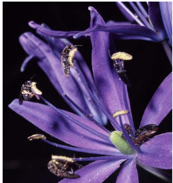
Flowers providing nectar and pollen are a necessary part of pollinator habitat.

Secure, stable nesting sites and flower-rich forage areas are key components of pollinator habitat. The outright loss of this habitat is the greatest direct threat to pollinators. Sometimes the loss is dramatic—a meadow converted to a shopping mall, for example—but often it is more subtle. Sites may remain green but still lose plant diversity or nest sites; an agricultural field or an expanse of mown grass usually is of little interest to a bee or butterfly.