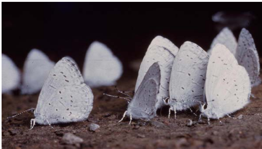
Although generally thought of as flower-visitors, butterflies also seek out a variety of other places to get necessary nutrition. Males of a number of butterflies, in particular swallowtails and blues (shown here), gather to sip at mud and puddles.

Although flower nectar is their primary food source, butterflies also get energy from the sugars in overripe fruit, tree sap, and aphid honeydew. Male butterflies gather essential nutrients and amino acids from non-plant sources such as muddy puddles, animal carcasses, dung, and urine. You may not want to scavenge for fresh road kill for your course (although dead animals have value in wild areas), but there are some ways to provide suitable forage that you may want to consider. Along creeks or on the edge of ponds, make sure there are some sandy or muddy places. Elsewhere, dampen a shallow depression of sand and let it dry out each day. If you have fruit-bearing trees, leave some to rot.