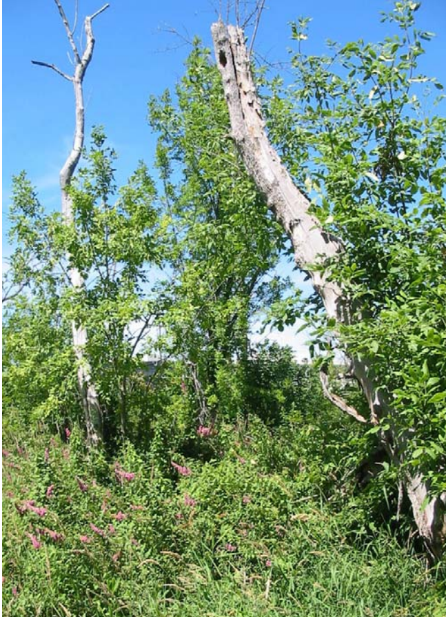
Native pollinators can utilize a variety of habitats. The snags in this photograph might serve as an important nesting place for wood-nesting bees.

areas may be a critical additional step for maintaining pollinators throughout the hot summer months.