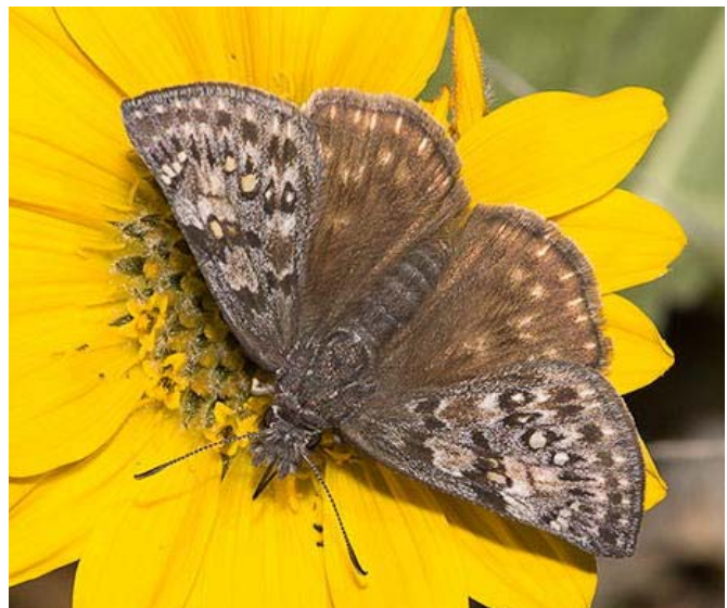
The Propertius duskywing nectars on many flowers as an adult, but its caterpillars will eat only Garry oak in this region.