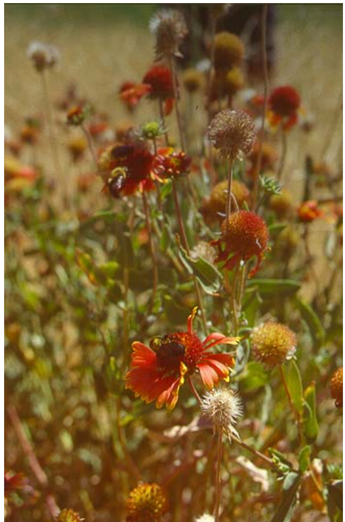
Protecting existing native plants, such as the blanket flower shown here, or planting new patches of plants will add visual diversity to courses and enhance them for nectar-drinking insects.

Jim Cane and Vince Tepedino USDA-ARS Logan Bee Laboratory