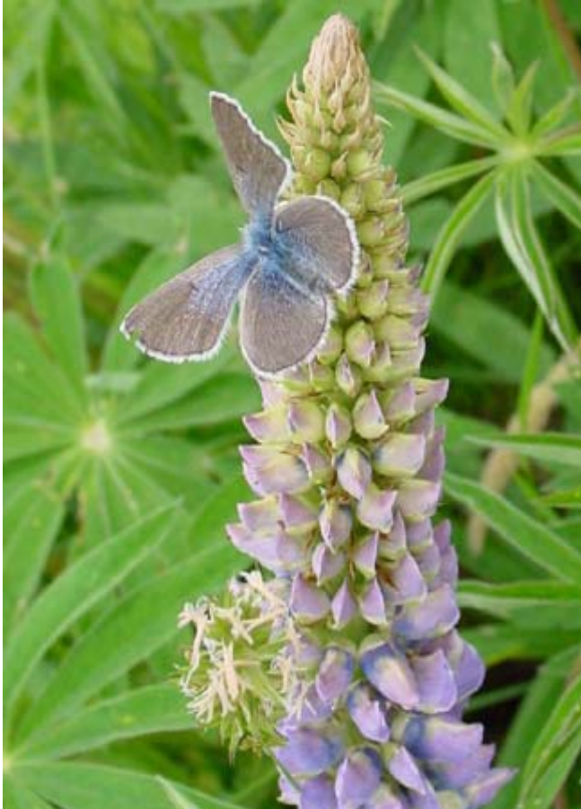
Hostplants on which caterpillars feed are a critical part of butterfly habitat. Silvery blue laying eggs on broadleaf lupine.