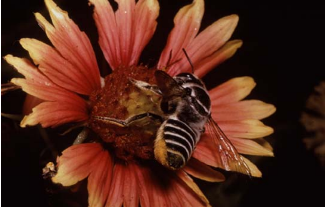
Bees provide flowers with the vital service of pollination. Native bees are the most important single group of pollinators in North America.

places where pollinator-friendly practices could be adopted.