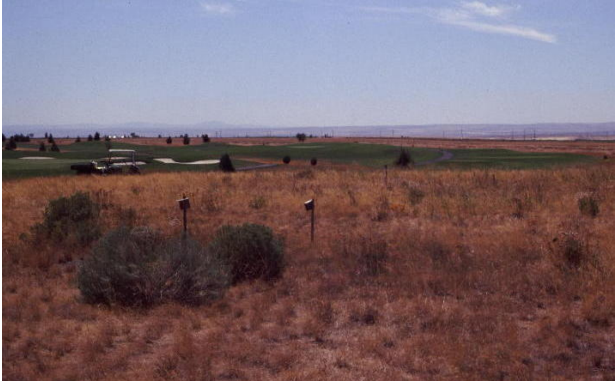
The wide-open spaces of many golf courses contain acres of out-of-play areas that could support abundant populations of butterflies, bees, and other pollinators.

The following sections, combined with and Making Room for Native Pollinators , cover in greater detail how to enhance habitat, how to provide necessary resources, and how specific park management practices may be altered to reduce negative impacts on our native pollinators.