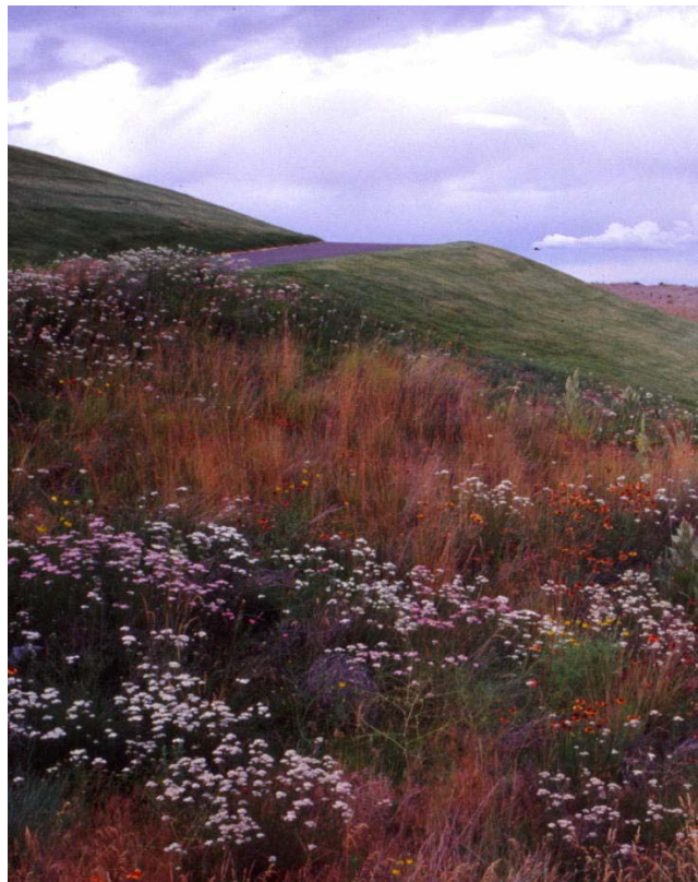
Out-of-play areas, cart track verges, and awkward-to-mow corners behind tees are among the areas that could contain pollinator habitat.

To a great extent, good hostplant areas will be the same as good foraging areas. Diverse forage patches will almost certainly include a variety of hostplants. Because the caterpillars of many butterflies feed on trees, be sure to inventory your tree resources. For example, hostplants of the tiger swallowtail include willow and black cottonwood, Protoparce duskywing caterpillars feed on Garry oak, and cedar hairstreak caterpillars eat western red cedar. Pay particular