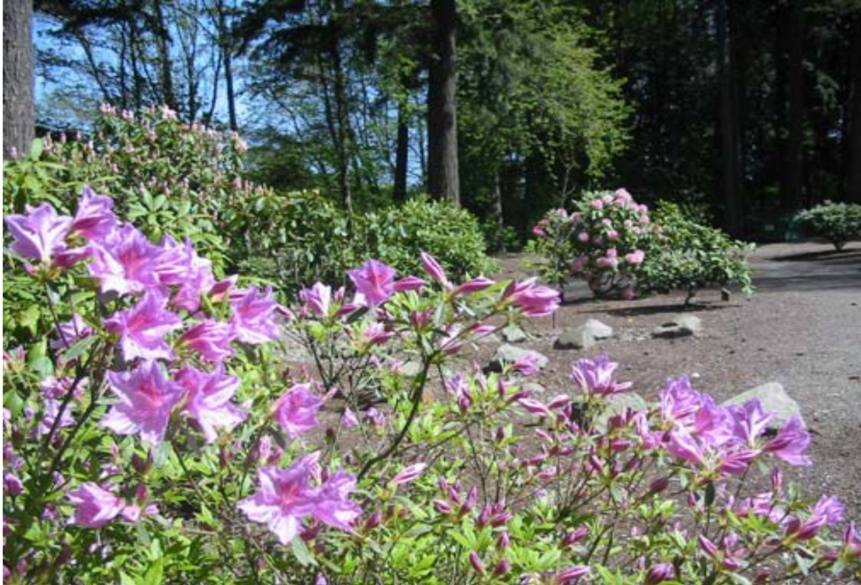
Pollinator conservation can be incorporated into any area of your course, including places traditionally not considered to be wildlife habitat. Formal landscaping, such as the rhododendron garden shown here, can offer nectar and pollen sources.

flower structure. In the process, they may have inadvertently lost their ability to produce nectar and pollen. Modern roses, for example, may have multiple petals in the place of pollen-bearing stamens. Wooden blocks and similar bee nest sites can be a helpful, even attractive, component of these areas.