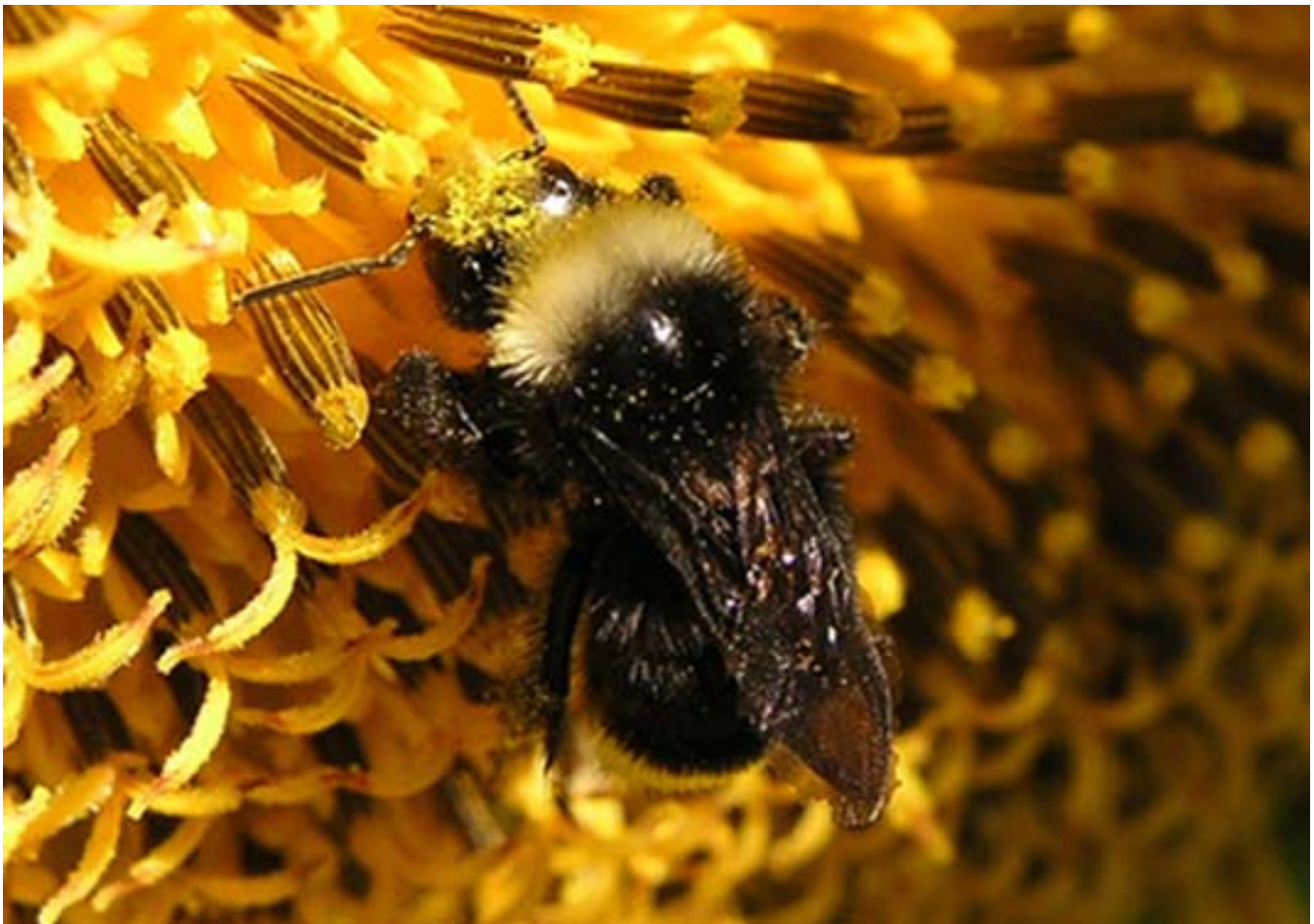
Large, hairy, and usually black with yellow, orange, or white stripes, bumble bees are easy to recognize. These native bees are important pollinators, and are among the first bees to be active in late winter or early spring.

In addition, pollinators help plants in other ways beyond pollinating flowers. The tunneling activities of ground-nesting bees, for example, improve soil texture, increase water movement around roots, and mix nutrients into the soil. The larvae of pollinating beetles that tunnel in old trees increase soil fertility by helping to break down decaying wood, thus returning the nutrients locked away in the tree back into the ecosystem. The larvae of many syrphid flies (as adults, important pollinators of many plants) reduce damage to plants by eating aphids and other soft-bodied plant pests.