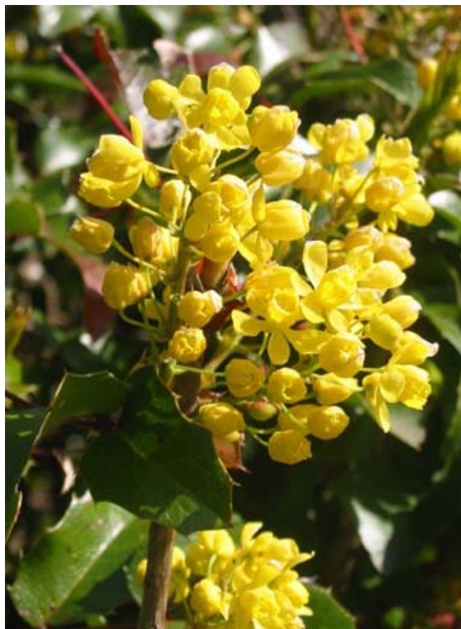
Good colors of flowers for bees are blue, purple, violet, white, and yellow (such as this tall Oregon grape). Butterflies like many of these and are also attracted by red.

Research shows that sites with at least eight species of plants flowering simultaneously attracted a greater number and diversity of bees. This strategy will enhance your park's ability to attract and keep pollinators.