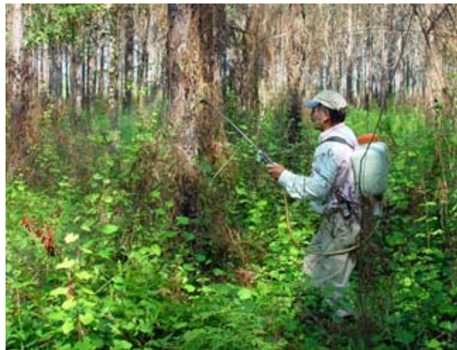
Pesticides impact pollinator insects in many ways. Reducing pesticide risk is an important step toward creating healthy habitats for pollinators.

The first step to protect pollinators is to reduce the need for pesticides. Pests can be controlled naturally, with a little patience on the part of staff. A healthy, diverse pollinator habitat has all the elements needed to encourage other beneficial insects, such as native predators or parasites of pest insects. The use of pesticides, however, often causes long-term problems by eliminating these natural enemies and upsetting the balance in the ecosystem. Whereas pests can quickly colonize and multiply in new areas of habitat, pollinators and beneficial predators may take years to return to pre-spray levels. In the weeks after an area is treated with insecticides, the pests will return, but beneficial insects will not.