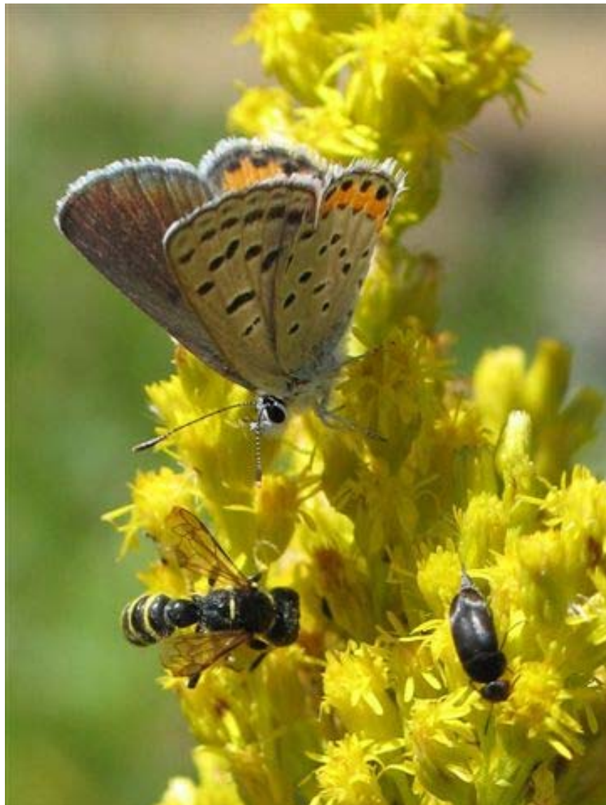
Valuable pollinators include (from lower left) wasps, butterflies, and beetles.

Another reason to focus on native bees and butterflies is that the natural history and habitat needs of these insects are better understood than those of pollinating flies or beetles. Consequently, there are well-established conservation techniques for bees and butterflies, practices that will also benefit other pollinators and species of wildlife.