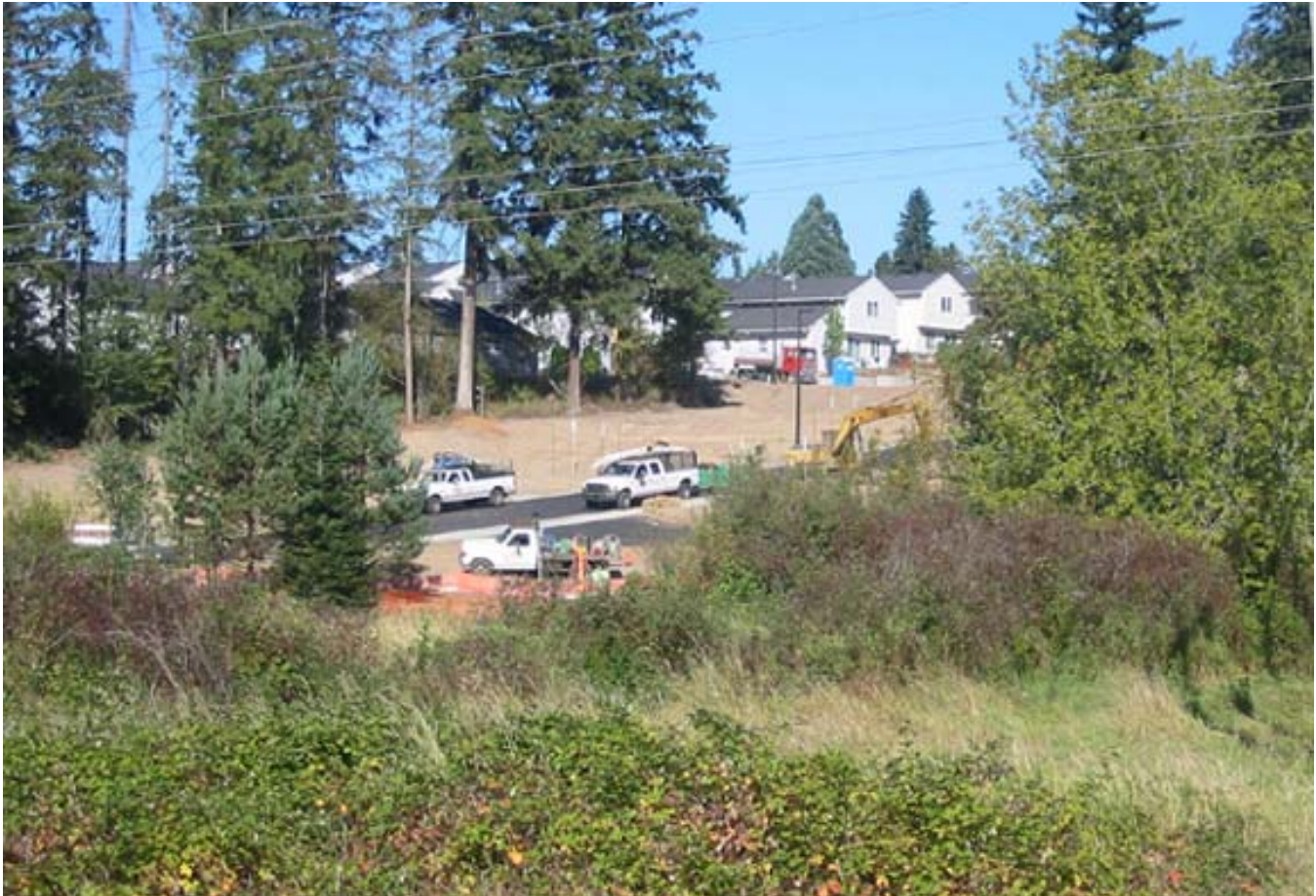
The construction of new neighborhoods is one cause of habitat loss and fragmentation, and one reason why golf courses and other greenspaces are becoming increasingly important refuges for pollinators and other wildlife.

Fragmentation of habitat is a second threat. The patches of habitat left after conversion to housing, industry, or agriculture—such as hedgerows or grassy verges—might be too small to support adequate nest sites, hostplants, or forage areas. Or, they may be too far apart. Although bees do not require large, contiguous areas of habitat, patches need to be within flying distance of each other. Most bees fly a couple of hundred yards or less between nest and forage. Butterflies can also suffer if habitat is too fragmented.