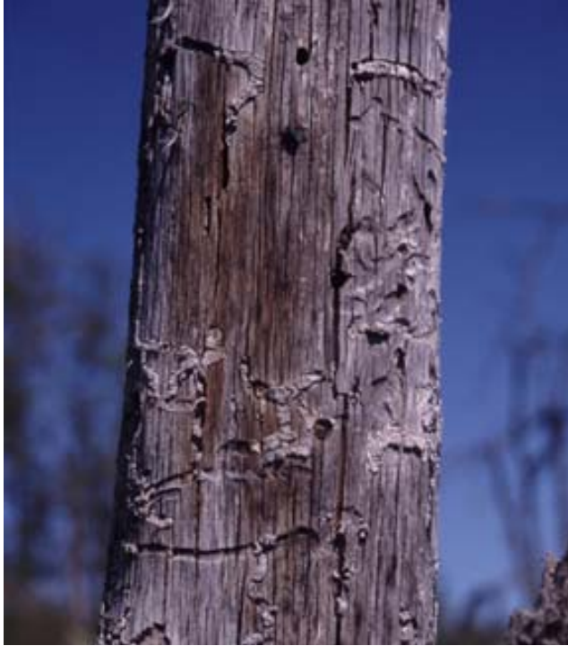
Beetle-tunneled snags, like this one, and patches of bare ground are important nesting sites for solitary bees.

As social bees that live in a colony, bumble bees need a small cavity, such as a discarded mouse nest, in which to build a cluster of waxy, pot-shaped brood cells. A queen founds a colony in spring after she emerges from hibernation. Depending on the species, the colony may be active for only a few weeks or for several months into the fall, at which time most members of the colony die. The last brood to emerge from a colony are queens and males; they mate, the males die, and the mated queens enter hibernation.