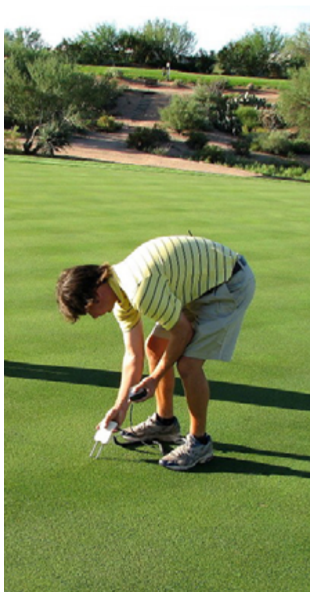
There is a wide range of hand-held moisture meters available that are all very accurate and cost effective.

Fortunately, the introduction of portable moisture meters and in-ground wireless moisture sensors to the golf course market has greatly improved the accuracy with which soil moisture is evaluated, thus reducing the subjectivity of traditional techniques. Let's be clear. Moisture meters are not a replacement for traditional soil moisture evaluation techniques, diligent scouting for wilt, or other subjective means of assessing soil moisture status and making irrigation decisions. Instead, moisture meters and sensors give superintendents the ability to objectively assess soil moisture quickly and accurately, improving irrigation decision making, leading to water conservation and better turf for golf. Additionally, being able to quantify soil moisture