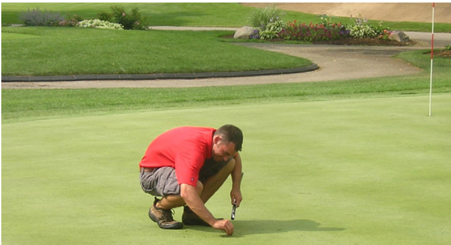
Moisture meters are not a replacement for diligent scouting for surface wilt and physically examining the soil for moisture. These traditional techniques are subjective, which is an inherent flaw that can be minimized with moisture meters.

Water is the most important natural resource used on golf courses around the world and, as such, conservation efforts should be a focus for every golf facility. It is our obligation as stewards of the environment to find ways to conserve water when and where possible. Moisture meters and sensors present an excellent opportunity to do so. A slight reduction in daily water use is likely if you have a more accurate understanding of the moisture in the soil when using moisture meters or sensors. For example, with better knowledge of the moisture in the soil, perhaps a fairway irrigation cycle could be reduced by a minute or two, which for an average 18-hole facility in the Northeast could translate into saving millions of gallons of water over the entire season (GCSAA Environmental Survey Data, 2008). Water savings will be even greater in areas of the country that use more water and have a longer growing season. Reduced water use