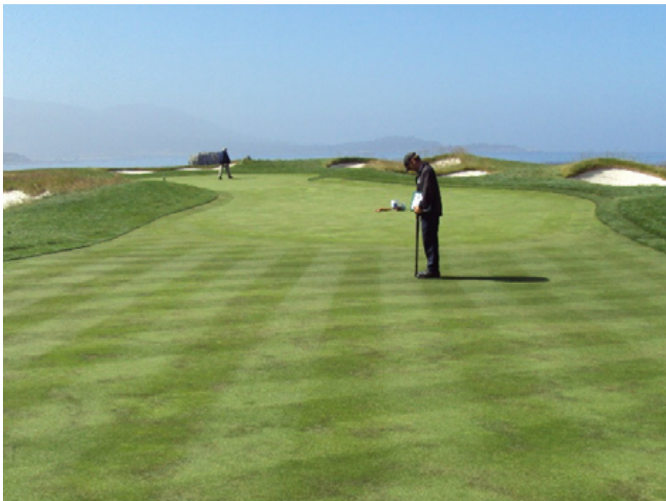
Although moisture meters have been used primarily on putting greens, their use is expanding to approaches, fairways, and tees to aid in moisture evaluation and irrigation decision making.

also translates into significant cost savings. Irrigation pumping expenses and costs for purchasing water add up quickly over an entire year. Consider the same situation: a fairway irrigation cycle reduced by one or two minutes could save thousands of dollars over the season if irrigation water is purchased from a municipality and significantly more in arid parts of the country (GCSAA Environmental Survey Data, 2008).