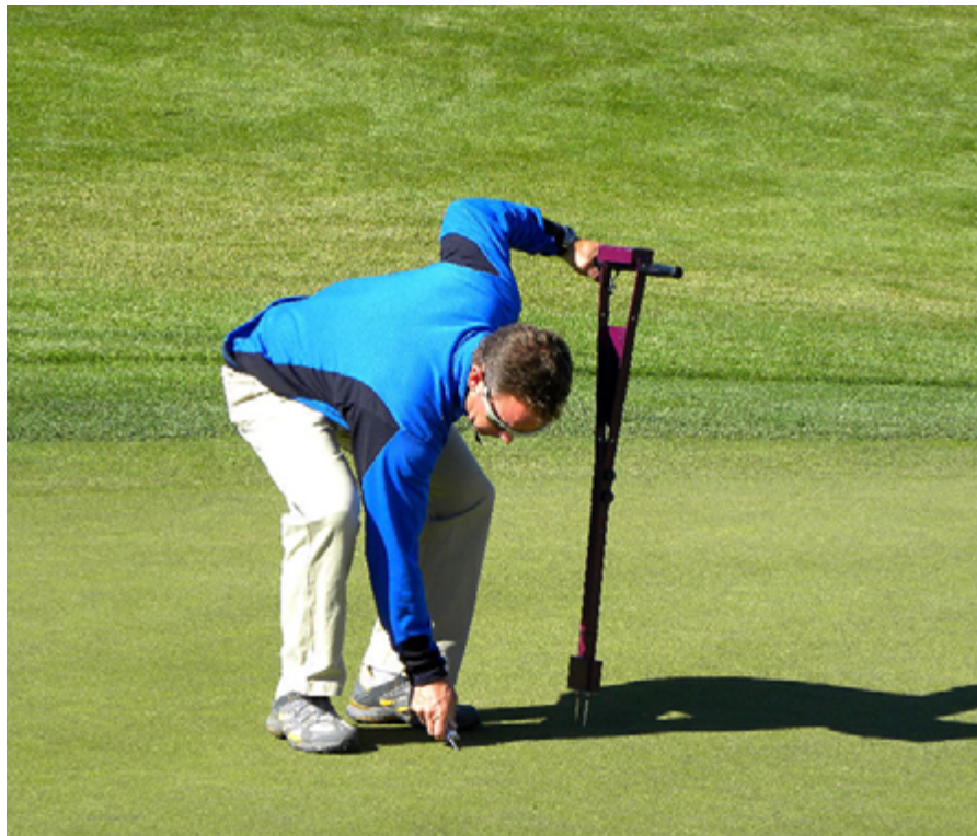
The Rules of Golf allow for repair of ball marks but not tufts created by spike marks. Tufts created by moisture meters can look very similar to spike marks, so the operator should gently tamp down any tufts created when checking soil moisture to avoid any confusion.

firmness are rated on an alphabetical (A-D) and numerical (1-5) scale, respectively, with the subsequent values dictating the amount of water applied to the green. Sean has a member of his staff obtain moisture measurements that then are translated