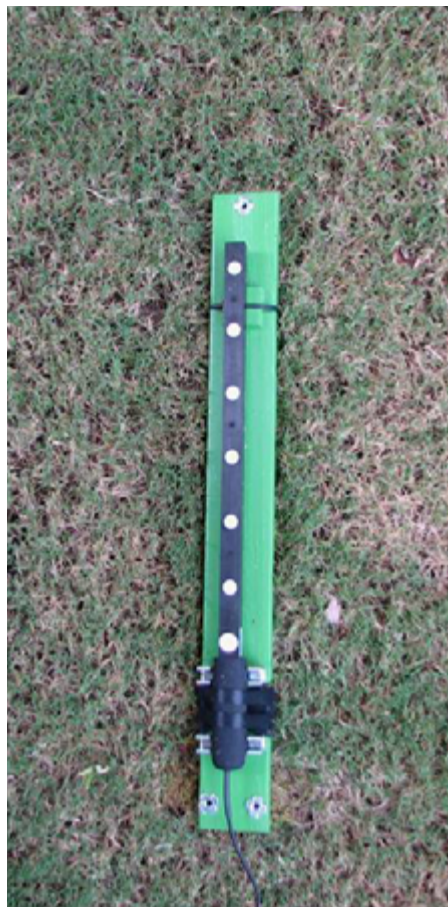
Meters with multiple sensors are now financially affordable and can be used as a tool in assessing the quantity of photosynthetically active radiation (PAR) for turfgrass plants.

deemed unsuitable for an ultradwarf. In this case, removing trees or moving the green is necessary.