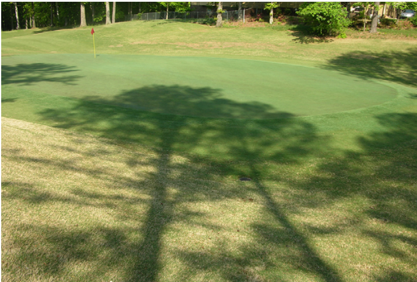
Shade from trees surrounding a putting green vary throughout the year due to the changing angle of the sun. The quantity of light for plant growth not only changes based upon shade, but on the time of day.

under varying levels of shade. They found that plots with four hours of sun (12 noon to 4 pm), applications of Primo, and a 3/16" height of cut, produced acceptable turf quality at a DLI of 22.1. These researchers concluded, "Therefore, applying a plant growth regulator that inhibits gibberellic acid and raising mowing heights will improve the growth, quality, and performance of ultradwarf bermudagrass greens in shade ( Bunnell and McCarty, 2004b )."