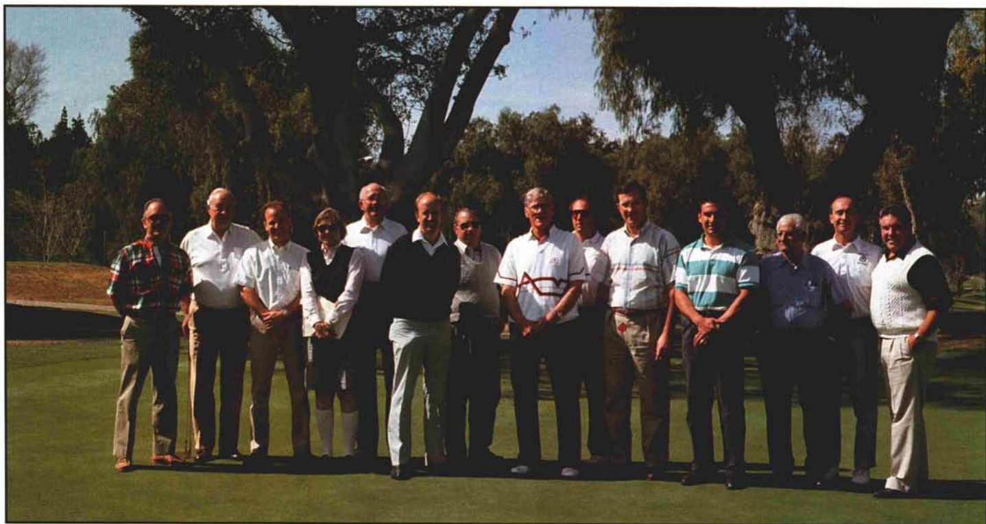
“The development of maintenance guidelines should be a cooperative effort between the superintendent, green committee, golf professional, and general manager. Once completed, the guidelines are a useful tool to communicate with golfers and compare the desired level of maintenance with the available budget resources.”

variations. They should fairly represent the needs of all levels of players at the course. The committee should consider several factors, including course architecture, the average handicap of the golfers at their course, the available budget, tournament schedules, and the amount of play the course receives annually. By analyzing this information, the committee should be able to provide a clear vision regarding the desired maintenance of the golf course. Then, the committee must approve a