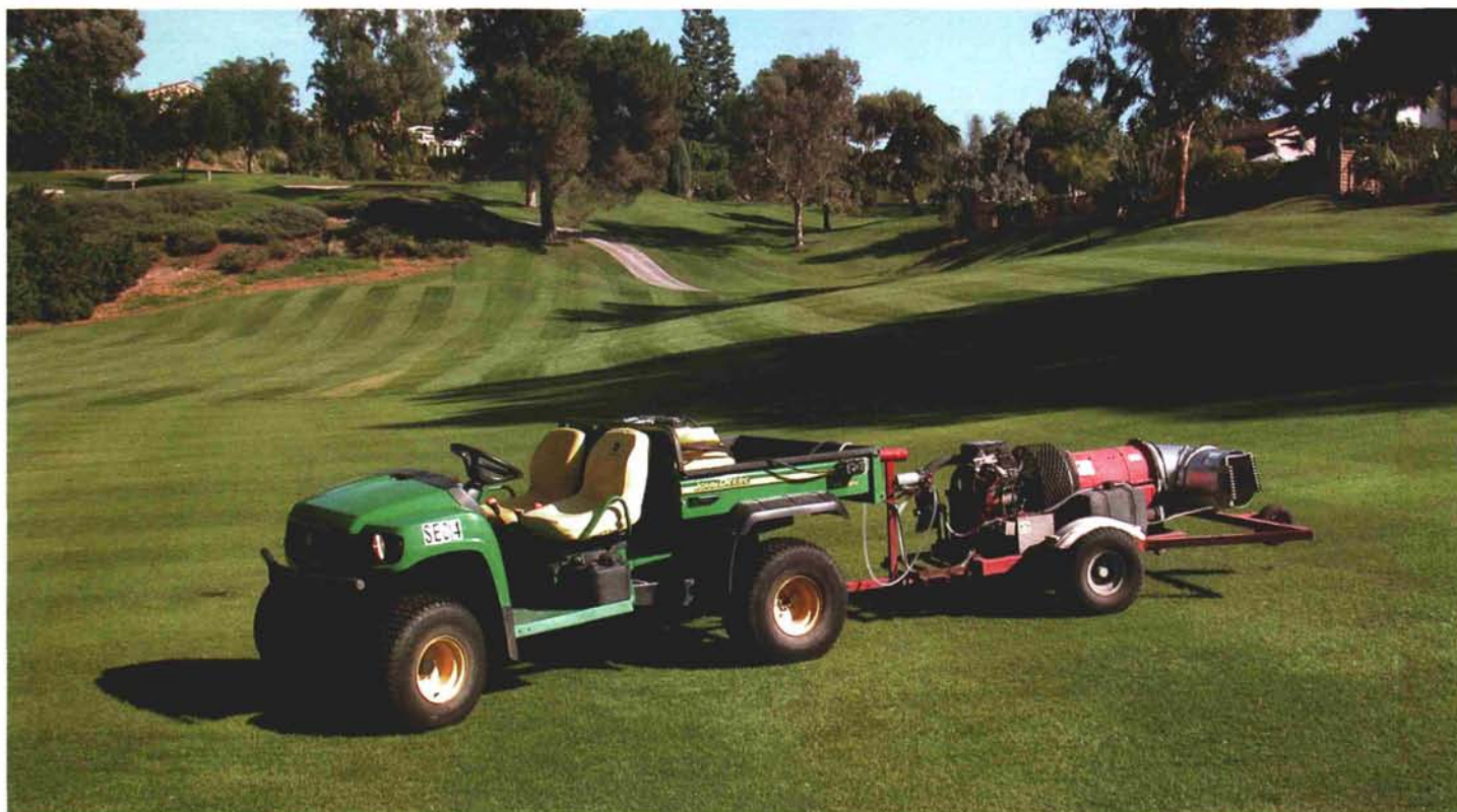
Kevin Hutchins at Mission Viejo Country Club fabricated a syringing system for greens using a utility cart and Buffalo Turbine Blower to help them save time on weekends and minimize interference with golfers.

Surviving a hot summer is difficult for people and plants. People, at least, can move into an air-conditioned building or turn on a fan. Plants, especially Poa annua and creeping bentgrass greens, are left vulnerable to the elements and often experience heat stress, wilt, and desiccation during a hot summer. The basic method used by most superintendents to keep greens cool during summer is to apply a light mist of water over the greens, known as syringing , in combination with insuring good air flow with the use of fans. This allows for good evaporative cooling to keep the surface of the greens below lethal temperatures.