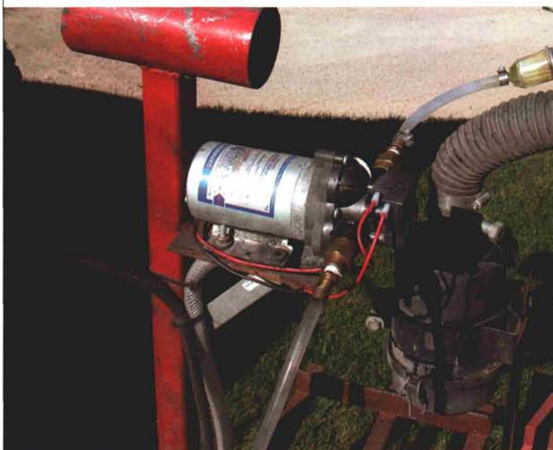
A small 12-volt diaphragm pump supplies water to the misting nozzles. An inexpensive in-line automotive fuel filter removes any debris in the water that could clog the nozzles.