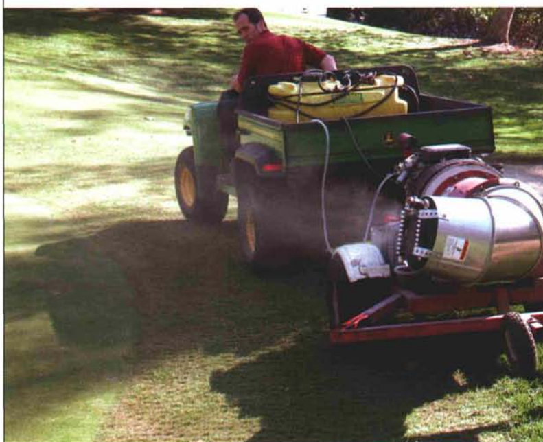
The staff at Mission Viejo Country Club typically uses this setup on Saturday and Sunday afternoons. With two passes around a green, it is possible to reduce surface temperatures by 16°F.