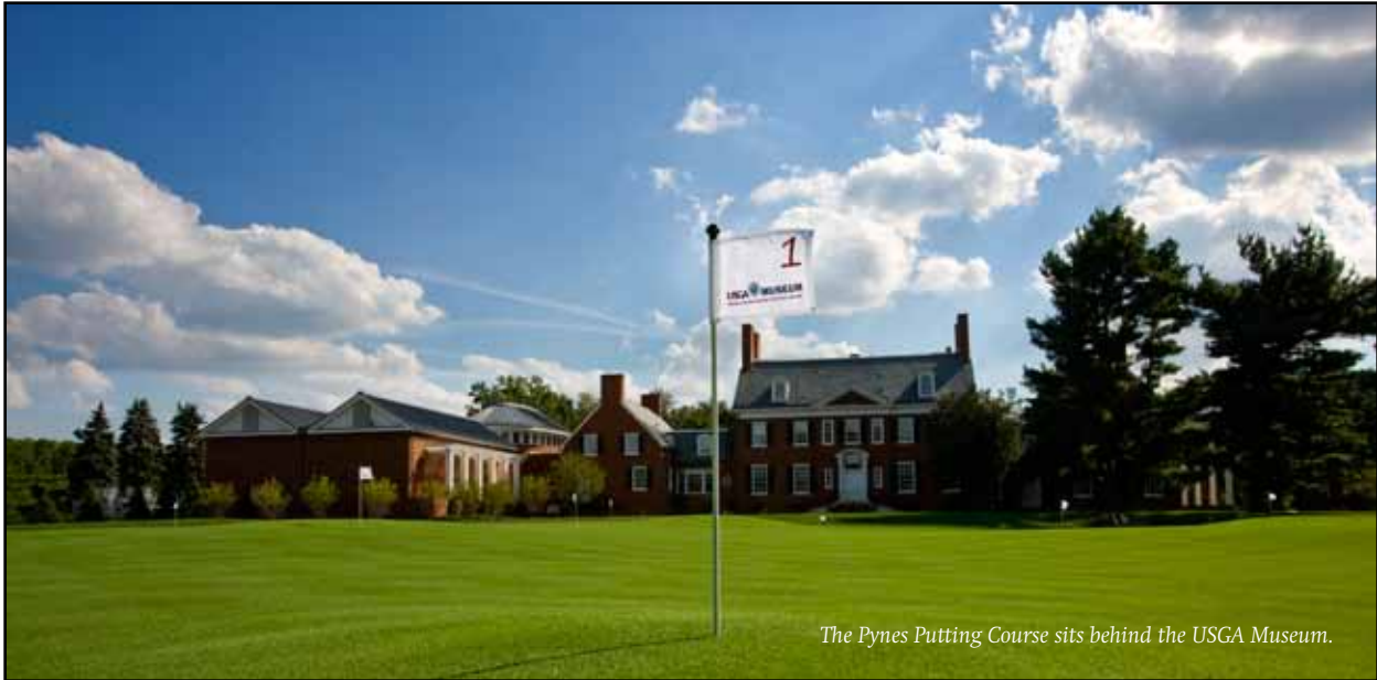
The Pynes Putting Course sits behind the USGA Museum.

The USGA Museum, located adjacent to the Association's headquarters in Far Hills, N.J., showcases the nation's largest and most significant collection of golf artifacts and documents. The interactive multimedia exhibits tell the story of the game's development in the United States, highlighting the greatest moments in the game's history, with a particular focus on USGA champions and championships.