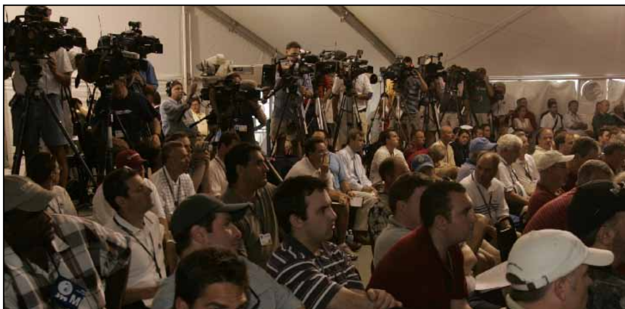
USGA championships attract large numbers of media.

The USGA has sold the exclusive rights to originate live, play-by-play coverage from the golf course at the three Opens and other selected championships. Other radio and television stations or networks are welcome to cover these championships with these limitations: