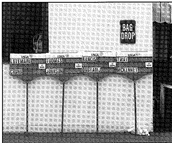
Scoring standards stood ready before the 2005 quarterfinal matches.