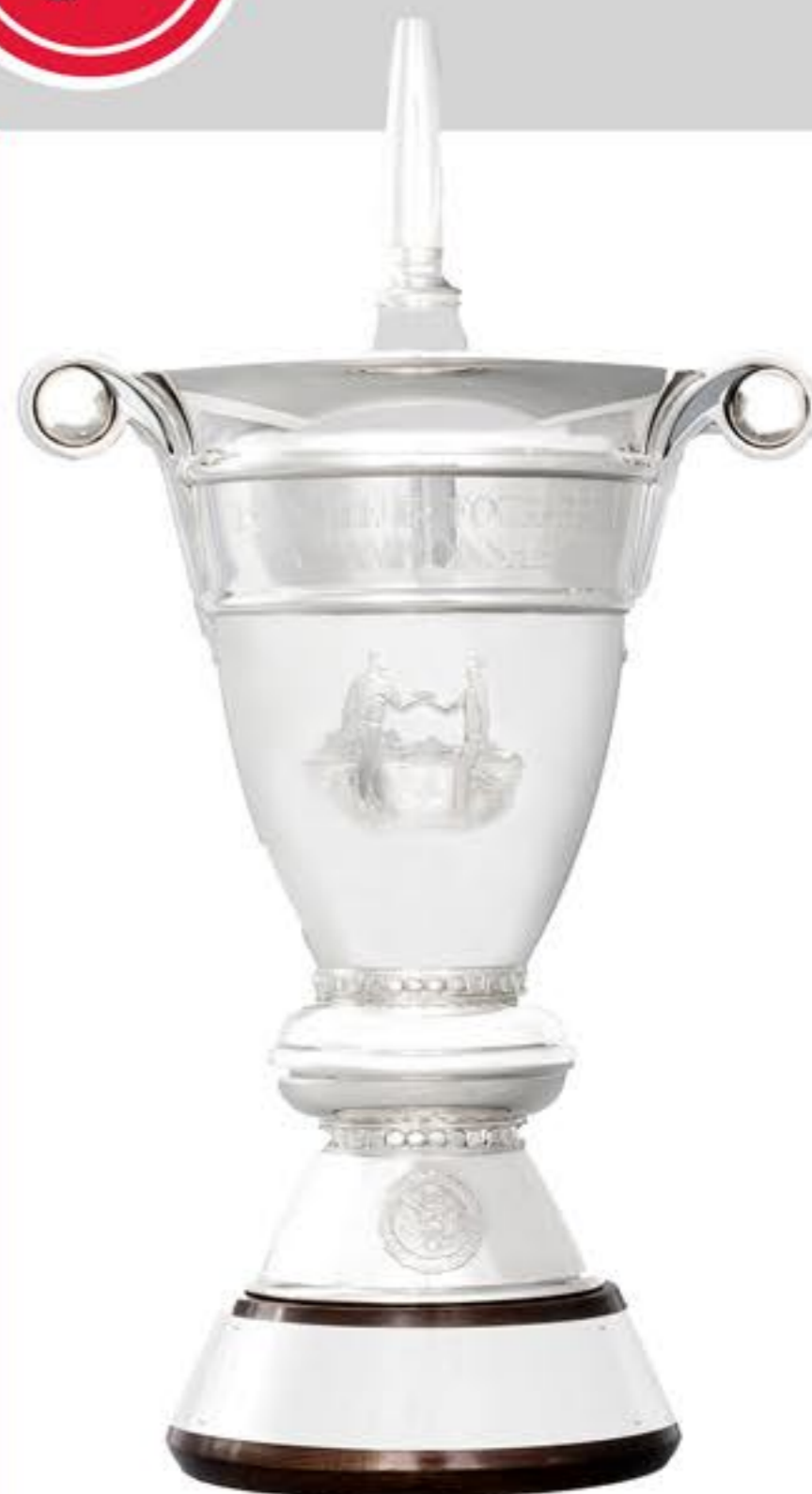
U.S. Amateur Four-Ball Championship Trophy